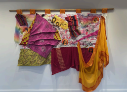
Monica Jahan Bose & Autumn Spears Hanging by a Thread , 2025, 90 x 95 in

Recycled mattress pad, Bangladeshi cotton saris, African cotton wax cloth, synthetic hair, thread, embroidery floss, acrylic yarn, acrylic and colored pencil on wood panels, velvet, sheer nylon rainbow fabric, kantha from worn and used saris, woodblock printing ink, bamboo pole.